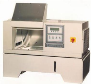
Solarbox 1500e with flooding