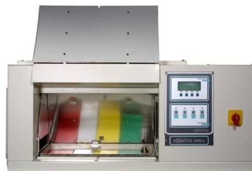
Solarbox 3000e: table top xenon testers 4 models